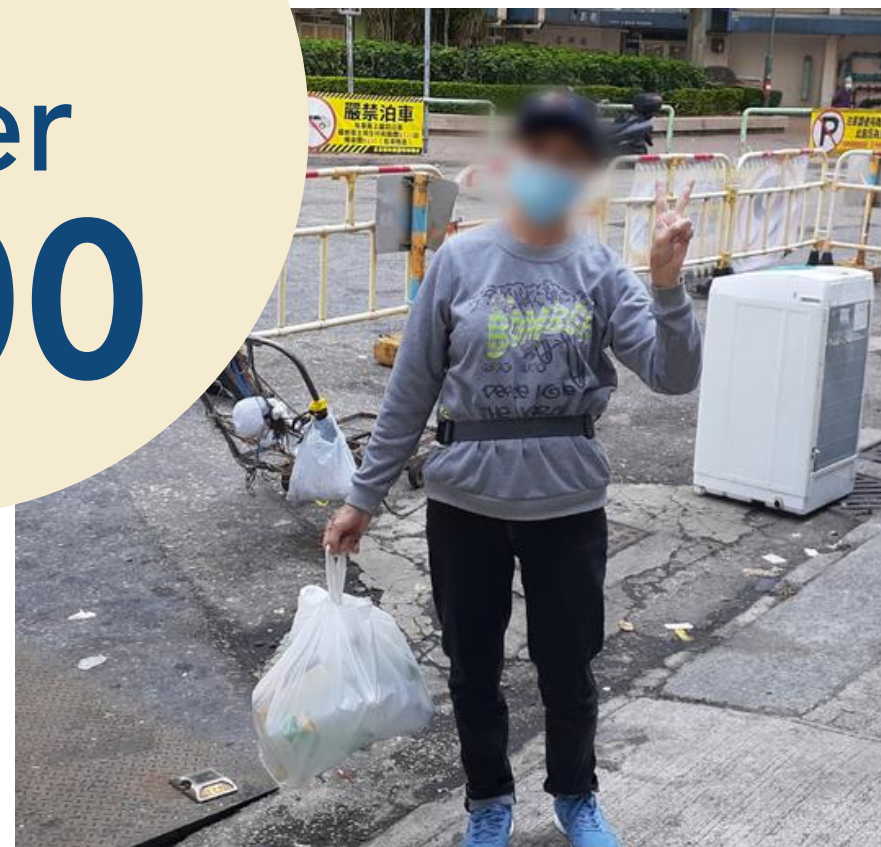
前線收集員 Frontline collectors