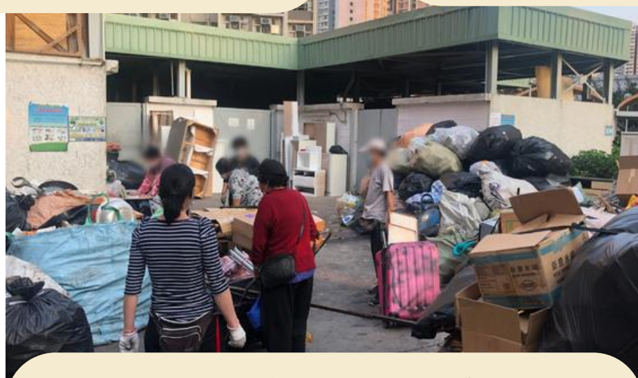
9 快閃回收站 Recycling pop-ups