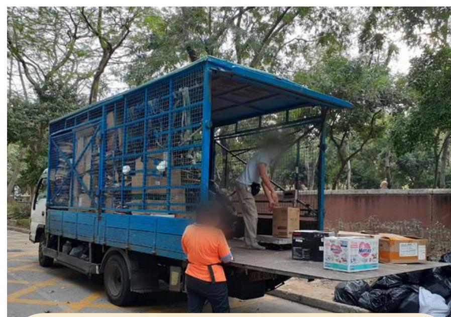
9 回收車 Recycling trucks