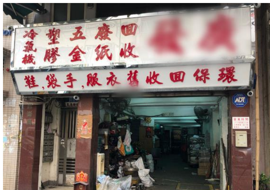
35 回收店 Recycling shops