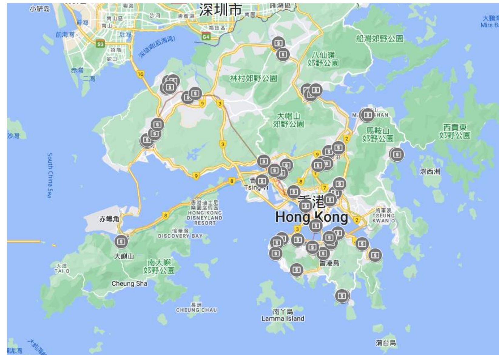
涵蓋全港17區 17 districts coverage